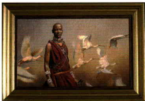
"The Birdman" by David Langmead/Oil on Canvas – 30 x 50 inches (unframed)

being carryovers from longer periods of time. "You can't