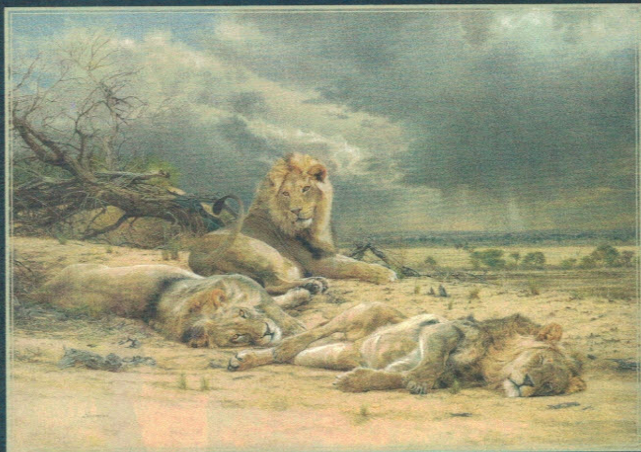
Seat of Power 44 1/2" x 63"

"I have spent most of my artistic career pursuing the beauty of nature. If I capture that beauty on canvas, then I feel my talent has been put to good use."