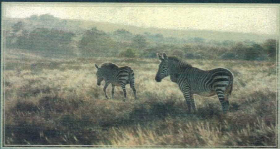
Mountain Zebra Mood 12 1/2" x 24"