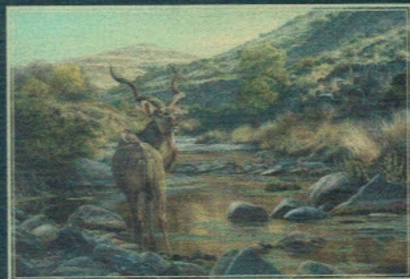
Kudu Haven 24" x 35 3/4"

After stretching and priming the canvases, he completes all the drawings. He then makes a detailed colored sketch of each piece, which gives him the opportunity to evaluate the composition and contrast of the work. Once all the pieces are at the color-sketch phase, he works each one individually until completion.