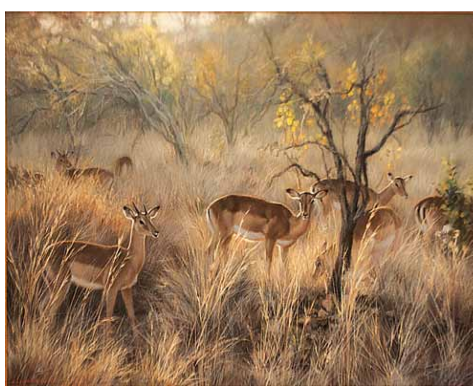
IMPALA-KRUGER