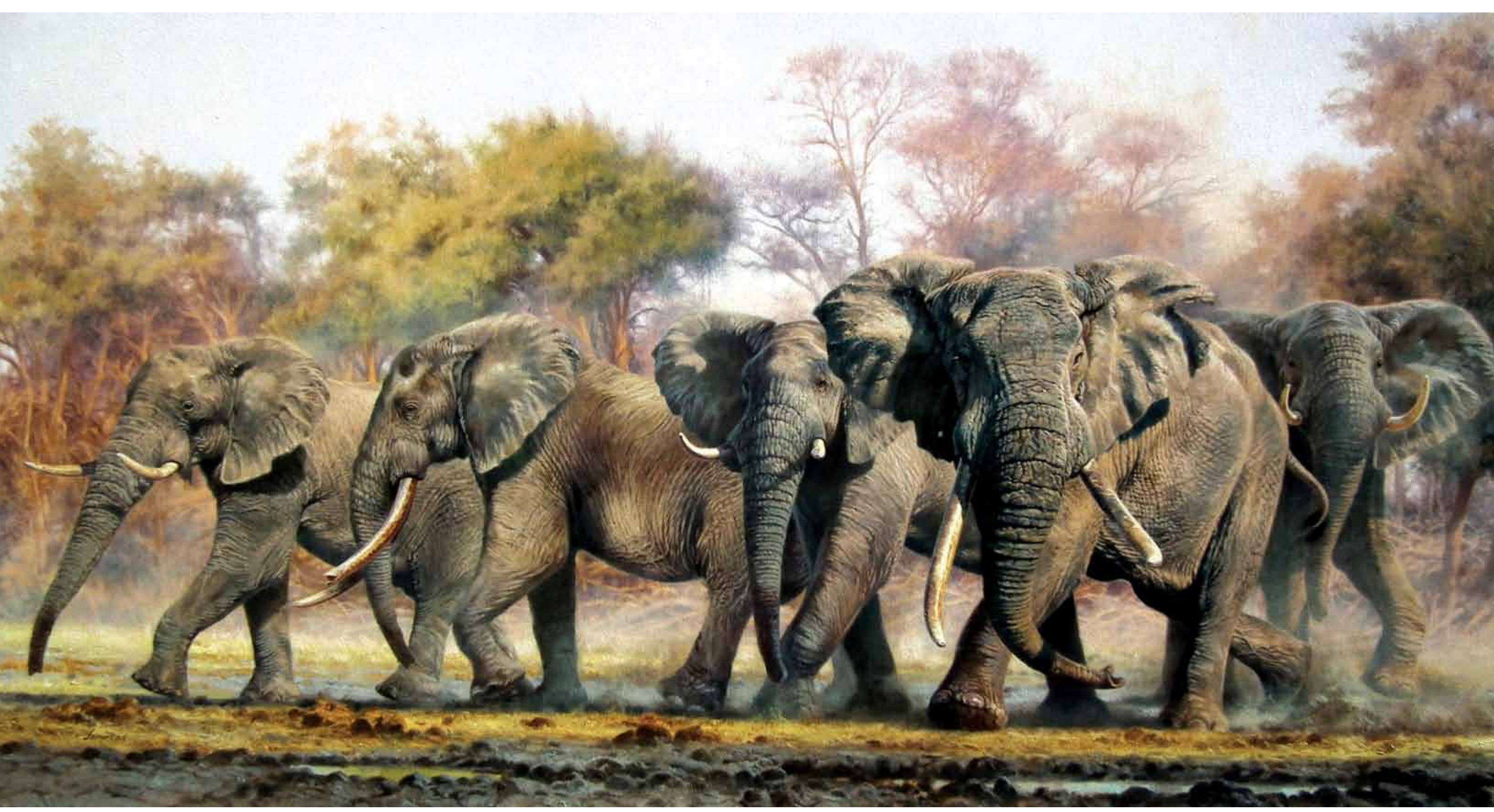
THE GRAND PARADE BY DAVID LANGMEAD