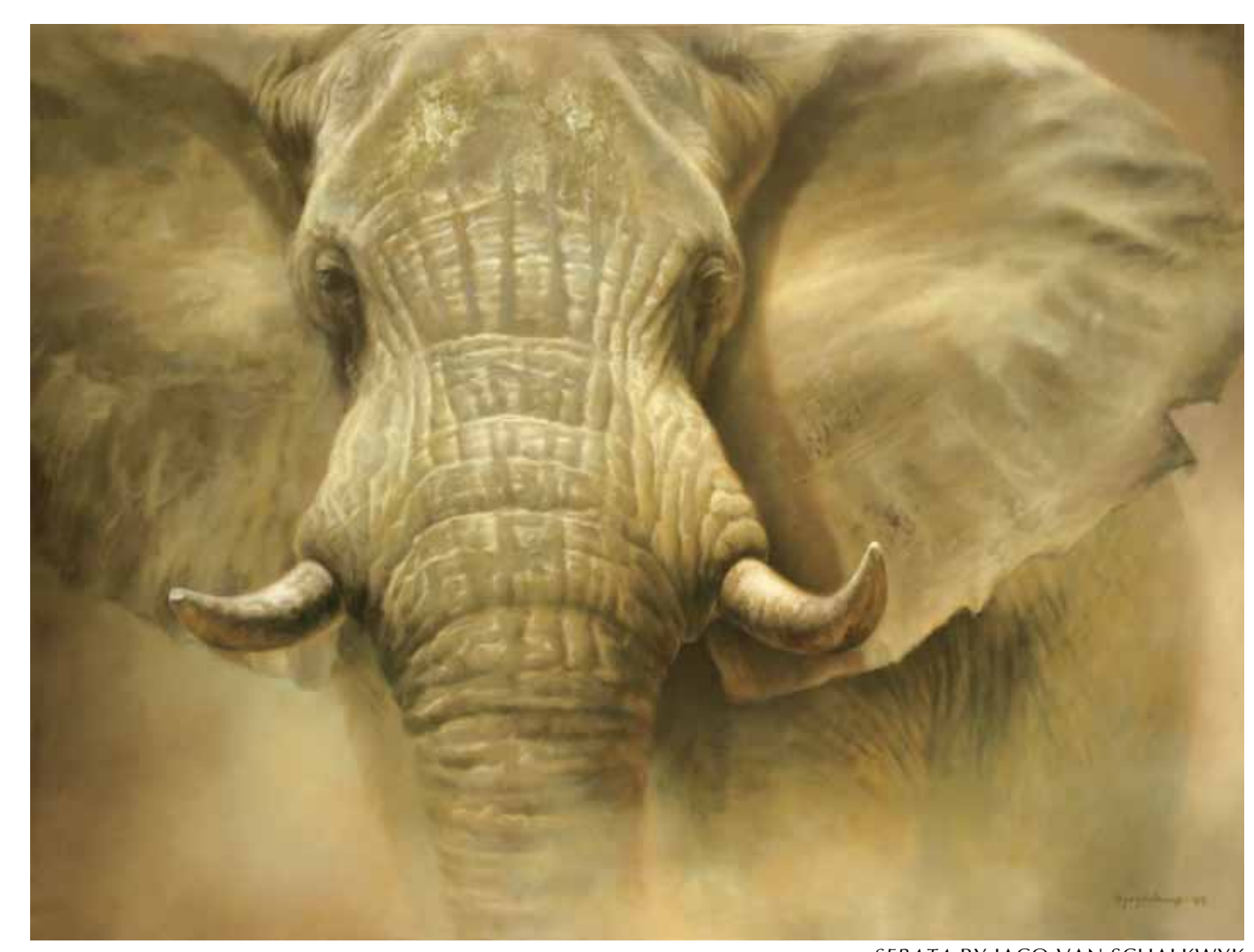
SEBATA