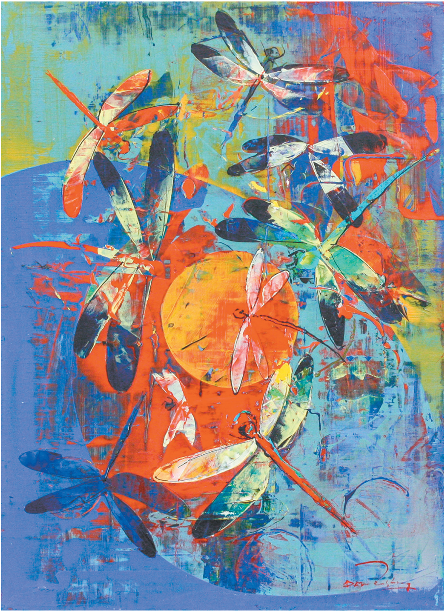
"Dragonfly Menagerie" 31¼" x 23¼" acrylic on canvas