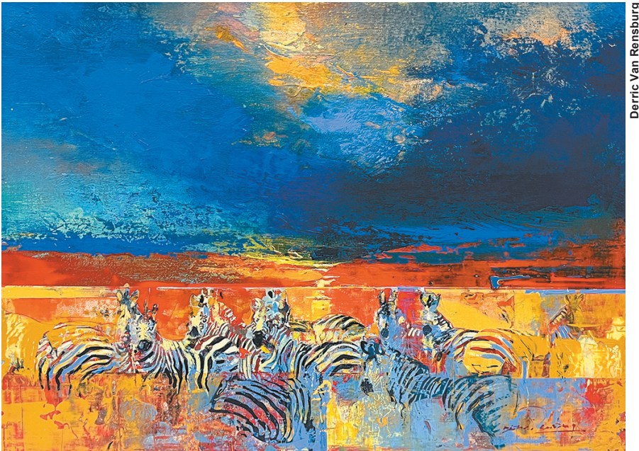
"Patterns" 21¼" x 29¼" acrylic on canvas

"I was convinced that I couldn't make a living out of it," but in 1979 he realized that he could be doing this full time and he excelled becoming one of the true heavyweights of the international art scene.